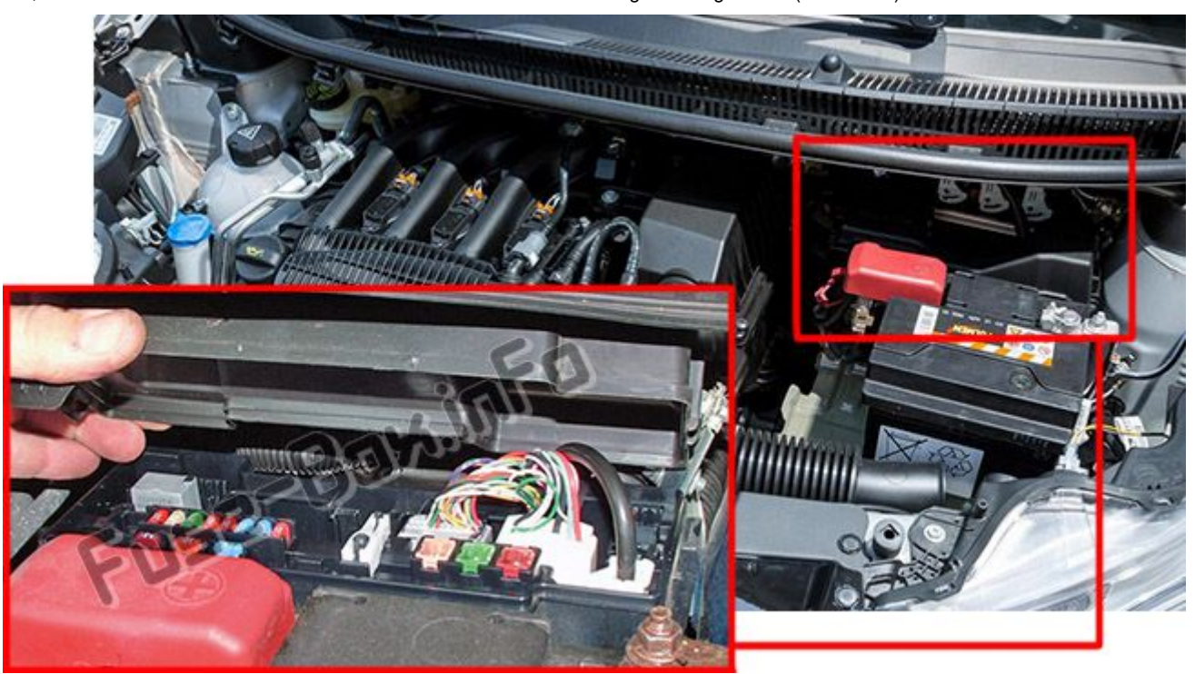
Unclip the cover, pressing on the right on lug E, to gain access to the fuses.